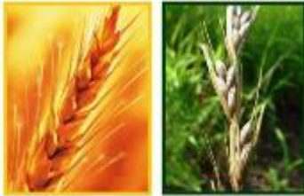
Wheat and Tares

Wheat and Tares – The Wheat is Christians The Tares are non-Christians (Matthew 13:36-43)