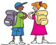
Mountie Backpack Program

MLP Gift Card Bingo is Saturday, October 25 at 11:30 am. Presale tickets are $20 and at the door $25. Tickets will be available before and after each service in the Narthex on these dates: Sunday, September 21 st and 28 th or anytime in the church office. To make this event a success we are asking the congregation for your support. Ways you can help: donate a gift card of your choice for our Gift Card Bingo; make a themed basket to donate for our Chinese Auction; or make baked goods to sell during the event. Deadline for gift cards and themed baskets is October 17 th . Baked good items are due Friday, October 24 th by NOON in the church office. PLEASE DROP OFF ALL DONATIONS TO THE CHURCH OFFICE.