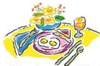
2nd Tuesday Church Ladies

Thank you to everyone who remembered us during the busy Holiday Season. We really appreciated all the Christmas & New Year Greetings, cards, cookies, candy, etc. You are all very special to us. The Staff at Messiah